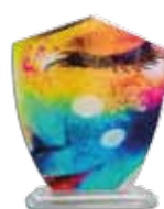
Awards and Trophies